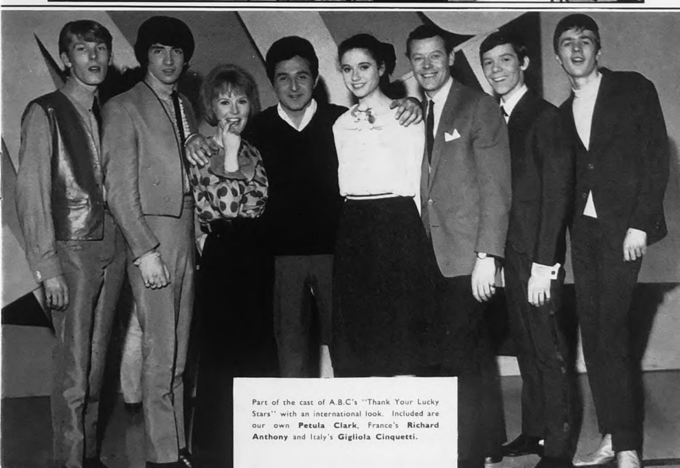
Part of the cast of A.B.C.'s "Thank Your Lucky Stars" with an international look. Included are our own Petula Clark, France's Richard Anthony and Italy's Gigliola Cinquetti.